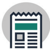
Local News Advertising

Adtaxi is a client-centric organization that brings scale, precision, and sophistication to digital marketing. Leveraging the belief that people matter as much as technology, we help advertisers solve complex marketing challenges with custom, performance-driven solutions.