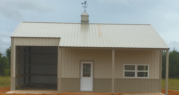
Includes Concrete Slab - Erected!

Our Goal Is To Provide You With An Affordable, Attractive, Long-Lasting Building Solution!