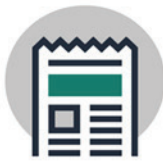
Local News Advertising

Adtaxi is a client-centric organization that brings scale, precision, and sophistication to digital marketing. Leveraging the belief that people matter as much as technology, we help advertisers solve complex marketing challenges with custom, performance-driven solutions.