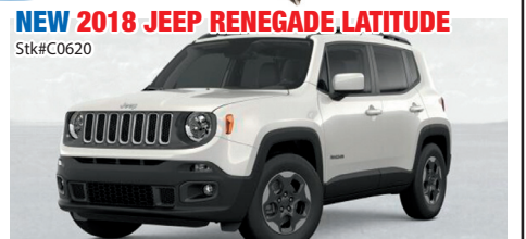
NEW 2018 JEEP RENEGADE, LATITUDE Stk#C0620 MSRP: $24,325 Dealer Discount: -$5,663