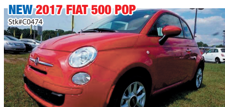
NEW 2017 FIAT 500 POP Stk#C0474 MSRP: $16,985 Dealer Discount: -$3,997