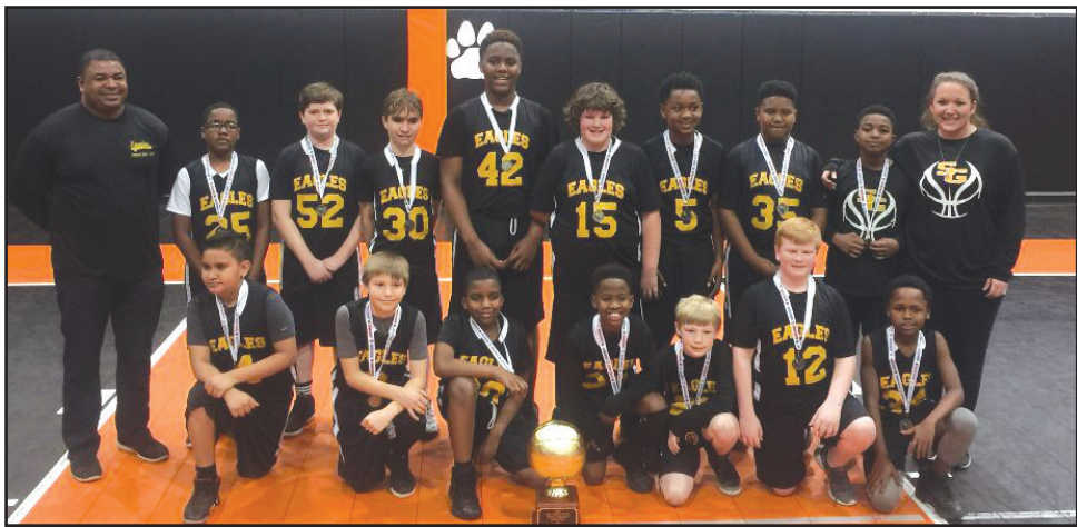
Shady Grove Eagles Pee Wee Boys: 2018 Jones County Youth Sports Conference Pee Wee Boys Champions Team Record 17-1.