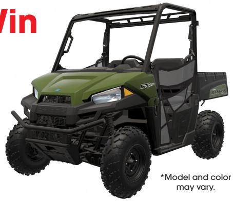
*Model and color may vary.