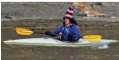
Kayak Canoe Race