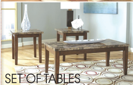
SET OF TABLES