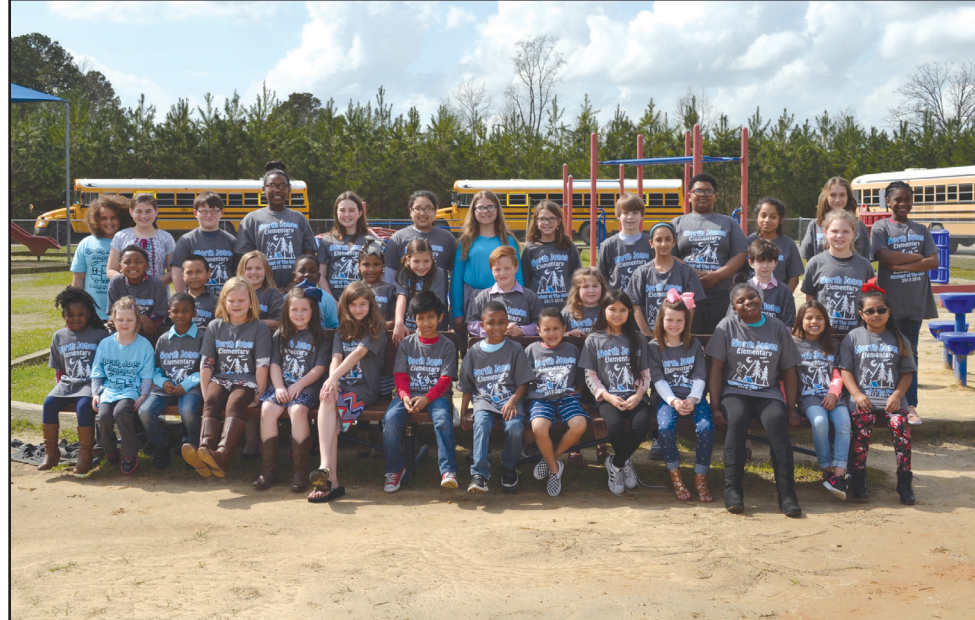
Bumpers came on February 28 to serve the North Jones Elementary Student of the Month and Bus Student of the Month students ice cream sundaes.