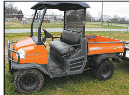
Kubota RTV900, diesel, power steering, 1,600 hrs. $5,850