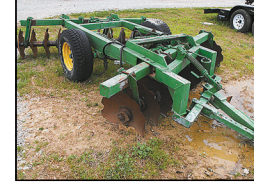
8' Bush Hog brand off set disc $2,000