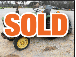
SOLD 750 John Deere, diesel, 404 hrs. w/4' rotary cutter, nice and clean $3,750