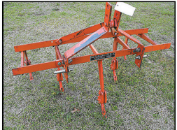
New 5 shank cultivator (only 1 left) $450