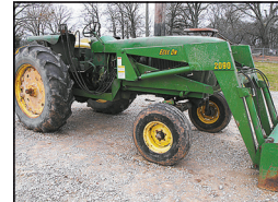
4320 John Deere, 115 hp, w/Ezz-on loader Sells Absolute on Auction Time, 4/11/18