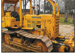
TD8 Dresser dozer, starts, runs, pulls good, won't steer, u/c worn out Sells Absolute on Auction Time, 4/11/18