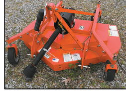
RD60 Woods finishing mower, new weathered, Make Offer!