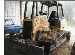
DC95 new Holland dozer, 6-way, joy stick controls, 3,100 hrs. $26,500