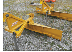
84' new HD tilt/angle blade $750