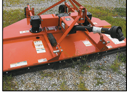
SE8 Rhino cutter, new w/ warranty, last one in stock $4,650