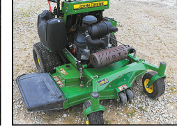
648R John Deere stand on mower, less than 400 hrs. $3,750