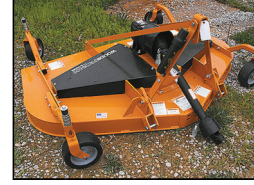
84' PRD Woods finishing mower, 2018 model, new, $3,350