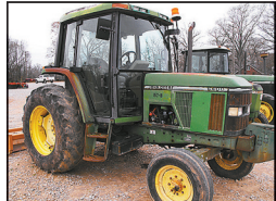
6400 John Deere, 90 hp, starts, runs, and works good, cold a/c, $12,900