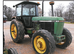
3155 John Deere, 110 hp, 4x4, original, starts, runs good $12,900