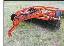
International 9' & 10' reconditioned transport disc, 3 to choose $2,750