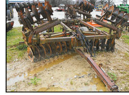
15' folding disc, Bush Hog brand, reduced $2,350