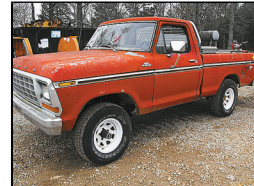
1979 Ford F150 4x4, SWB, auto, 351M, runs, works $3,850