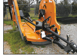
15' Woods batwing, new model BW15.5 w/ chains $12,800