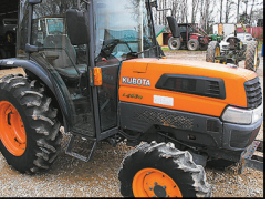
Kubota L4630, c/a, 4x4, mechanics special, glide shift trans. won't pull! $9,850