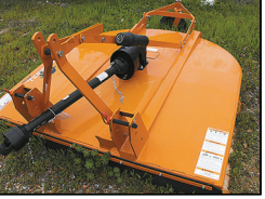
72' Woods Brush Bull w/clutch rotary cutter, 6 yr. warranty $1,995