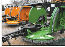
BW12 Woods 12' batwing, several just in! $9,850