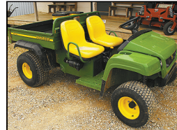
John Deere gator, runs and works good! $2,450