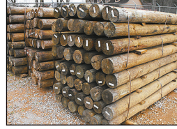
6'x8' treated post by the bundle, $12.00 per post X 28