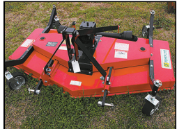
New 6' finishing mower $1,195