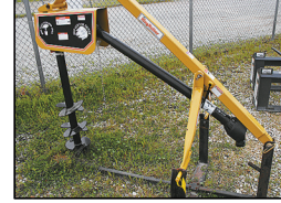
New King Kutter 9' auger $650