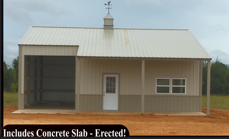
Includes Concrete Slab - Erected!

We Do All Types of Buildings. Shops - Garages - Hay Sheds - Storage - You Name It! We Have THE BEST PRICES On Erected Buildings! No Hidden Costs! The Strongest Buildings Available in ANY Size You Want! Fully Customizable To Meet Your Needs! Ask About Insulation!