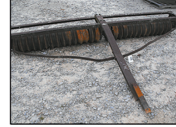
10' cultipacker $500