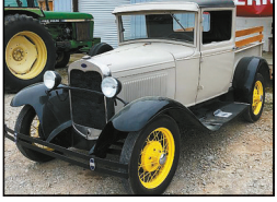
1930 Model A Ford Pickup, original flat four, 3 speed, runs, drives and shifts good! $15,000