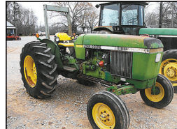
2350 John Deere, 60 hp, new engine and pto clutches, $7,500