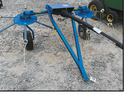
Ranch Right 2 basket tedder, new, last one! $1,450