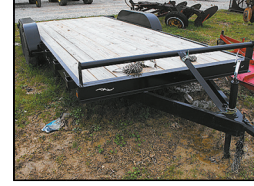
New 18' car hauler, dove tail and slide out ramps, $1,775