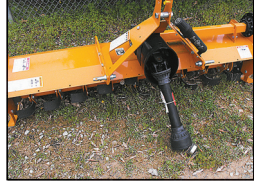
72' Woods tillers, new w/ clutch and gear drive, $1,795