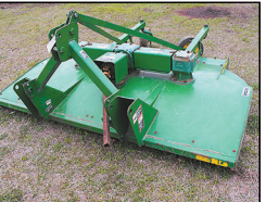
MX8 John Deere rotary cutter, nice! $2,850