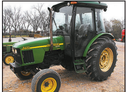
5420 John Deere, 88 hp, C/A, hrs. n/a, dual remotes, cold air $13,900