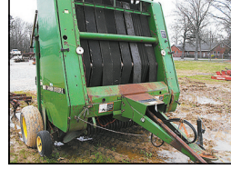
535 John Deere Baler w/monitor $3,650