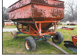
Large gravity wagon w/running gear $1,000