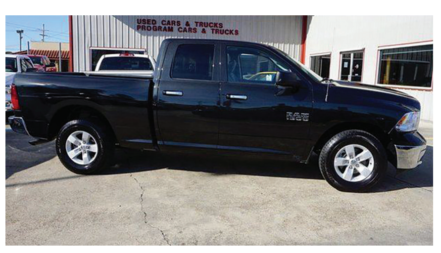
17 RAM 1500 SLT