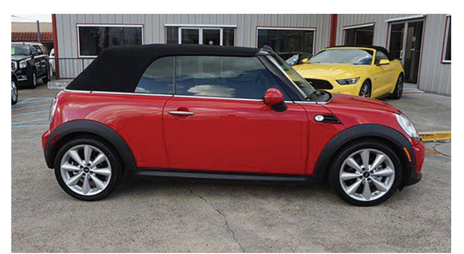
15 Mini Cooper Convertible #8J0043A.....$18,497