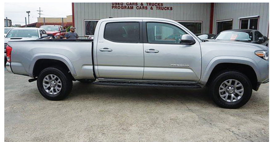
17 Toyota Tacoma SR5 $26,497 #7T0180A .....

USED CARS & TRUCKS PROGRAM CARS & TRUCKS