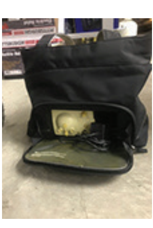
MEDELA PUMP AND STYLE ADVANCED breast pump. Great condition, $30. Call 985-