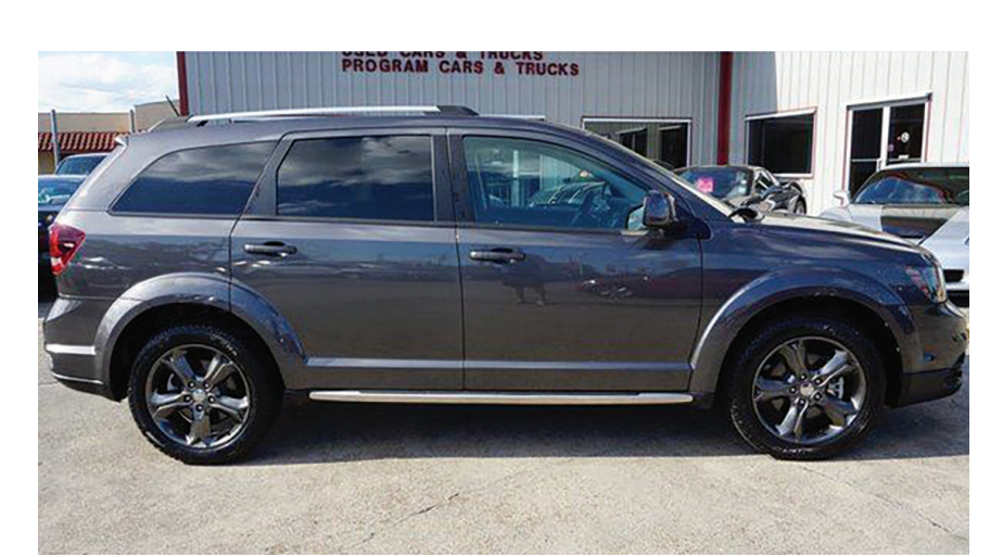
15 Dodge Journey Crossroad $16,497