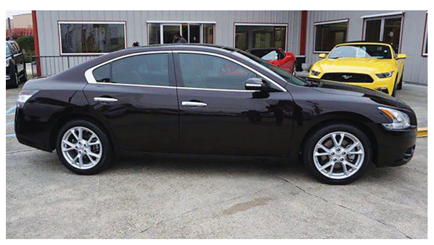
14 Nissan Maxima 3.5 SV #8J0083A.....$18,497