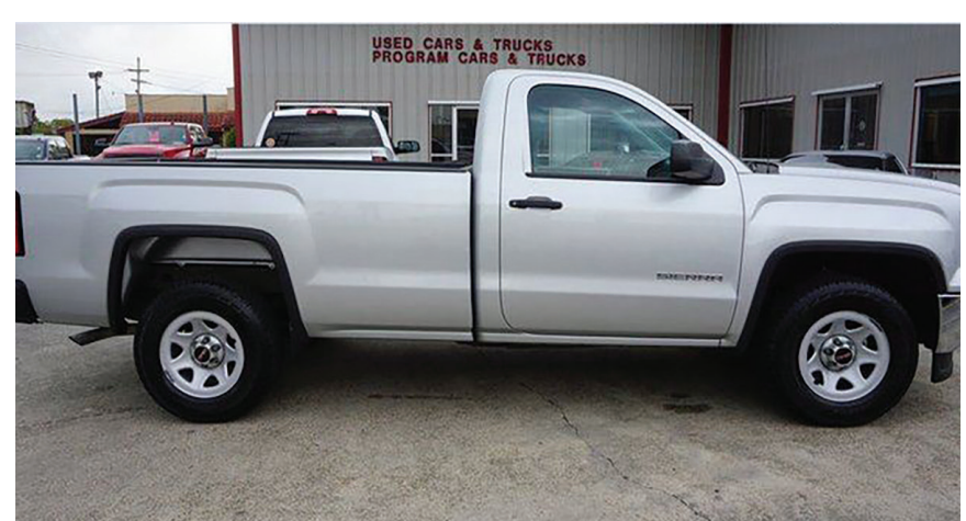
14 GMC Sierra 1500 $16,997