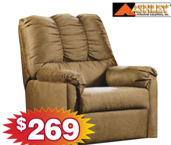
Ashley Rocker Recliner Available in 7 colors $269