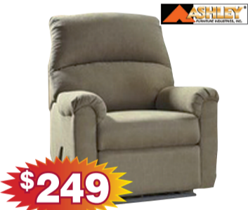
Ashley Wallaway Recliner Available in 2 colors $249