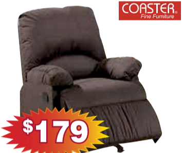
Coaster Wallaway Recliner $179