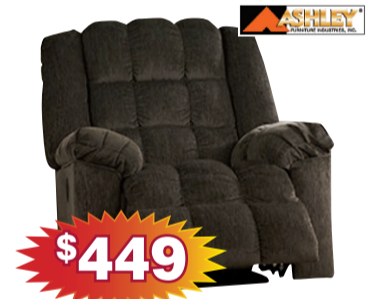
Ashley Power Recliner Available in 4 colors $449