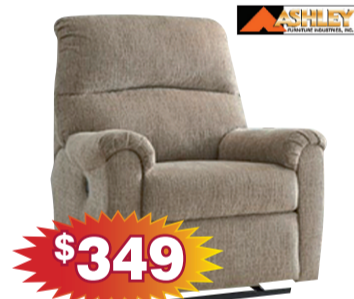
Ashley Power Recliner Available in 2 colors $349