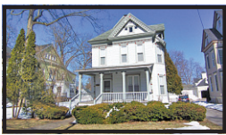
PRICED TO SELL!

But still want your privacy?! Great two bedroom home has an open floor plan! Large living room with fireplace, dining room and updated kitchen with appliances. 2 nice size bedrooms and 1 large full bath. Oodles of storage and a full dry basement! All on just under 3 acres! So nice! $124,900 Julie Stickels 315-363-9191 or 315-762-3434 (C)