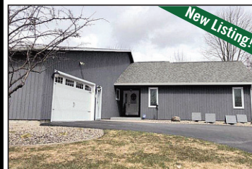
Vernon $259,900 Gorgeous Ranch, 3BR, 2BA, open floor plan, hardwoods, over an acre, a must to see.