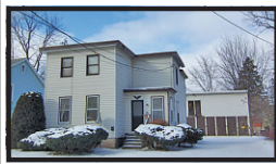
MAKE ME AN OFFER

1,700 square foot Victorian boasting foyer, living room, den, dining room, oak kitchen with appliances, 3 bedrooms, 1 1/2 baths, 2 stall garage and central air. Charm, hardwood floors and a great location! $109,500 Janet Mautner 315-363-9191 or 315-762-8683 (C)