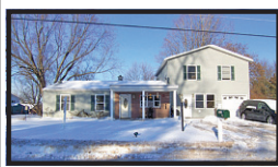
A FAMILY FRIENDLY HOME

So well kept, this 3 bedroom home boasts an updated kitchen , living room, dining room and family room. In addition, a dry basement and a 2 car garage with a 2nd story! Don't just drive by.... $104,900 Jayne Wentworth 315-363-9191 or 315-264-1456 (C)