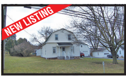
A REAL CHARM

So well kept, this 3 bedroom home boasts an updated kitchen , living room, dining room and family room. In addition, a dry basement and a 2 car garage with a 2nd story! Don't just drive by.... $104,900 Jayne Wentworth 315-363-9191 or 315-264-1456 (C)