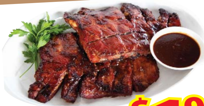
Fresh Seaboard Light Pork Spare Ribs 2 slabs per pack