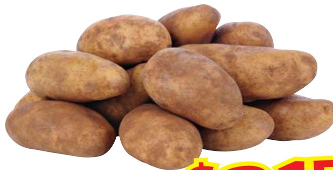
Russet Potatoes 8 lb bag, US #2