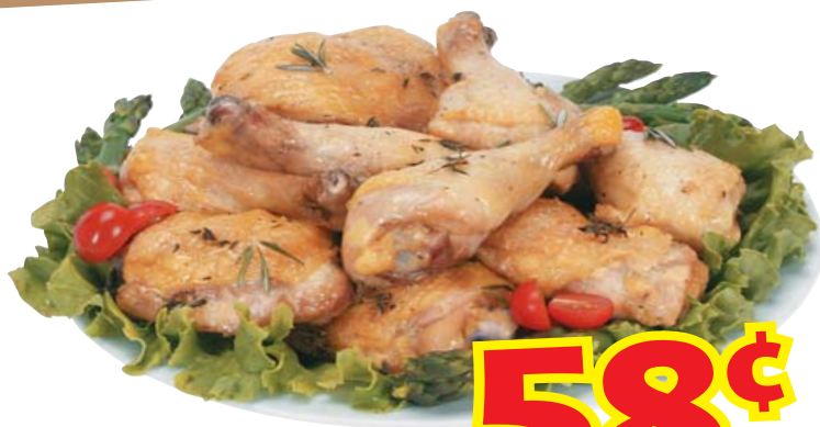
Fresh Chicken Drumsticks Tray Pack