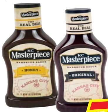
KC Masterpiece Barbecue Sauce 18 oz btl, Assorted Varieties