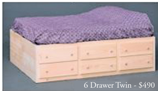
6 Drawer Twin - $490