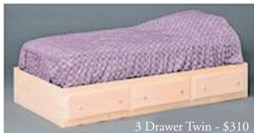
3 Drawer Twin - $310