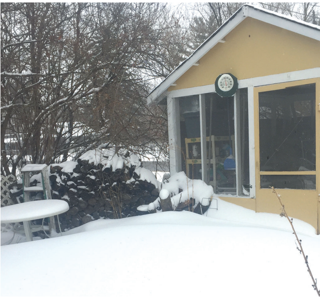
Backyard barbecues are on hold as snow fell with a vengeance throughout Minnesota on April 13, 14 and 15.