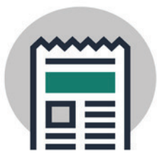
Local News Advertising

Adtaxi is a client-centric organization that brings scale, precision, and sophistication to digital marketing. Leveraging the belief that people matter as much as technology, we help advertisers solve complex marketing challenges with custom, performance-driven solutions.