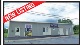
AN INVESTMENT! FOR YOURSELF?

Situated on a lot of 180' x 200', this spacious 3 bedroom 3 bath home offers great space and is in need of only interior cosmetics. Large family room and living room, eat-in kitchen, 2nd floor laundry , detached garage and a maintenance free exterior! Take a peek, you'll be impressed! $99,500 Jayne Wentworth 315-363-9191 or 315-264-1456 (C)