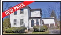
SELLER SAYS SELL!

This could be your next stop! Great land, great area and a great price! Needs some TLC but has great potential. Call today! $67,000 Julie Stickels 315-363-9191 or 315-762-3434(C)