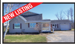
A HONEY FOR THE MONEY

This remodeled 3 bedroom home boasts 1,400 square feet and offers a living room, dining room and fully applianced eat-in kitchen with refinished hardwood floors, full bath, full basement and detached garage. You'll love the new siding, roof, appliances, carpeting, electrical entrance and more! $119,500 Jayne Wentworth 315-363-9191 or 315-264-1456 (C)