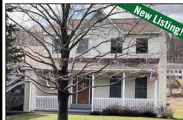
Chittenango $209,900 Sweet Colonial, meticulous, hardwoods, FR, formal DR, 2.5BA, spacious rooms and finished basement.