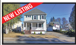
NO WORK NEEDED HERE

Fabulous completely remodeled 3 bedroom 2 1/2 bath Colonial boasts 2,100 square feet and offers a large living room with coffered beam ceiling, formal dining room open to a gorgeous cherry kitchen complete with appliances, 1st floor laundry, HWF's, central air, 2 car garage and 1.5 acres with city water. Just perfect inside and out. $224,500 Jayne Wentworth 315-363-9191 or 315-264-1456 (C)