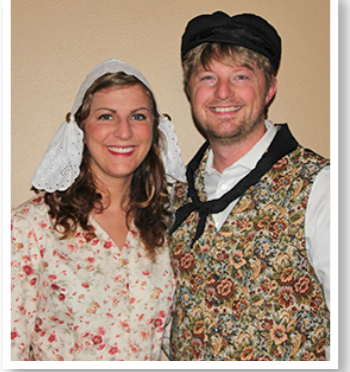
Win 1 of 2 Free $50 Beef Certificates from Woudstra's Meat Market

Area businesses ask you to join them in saluting our Beef Producers by enjoying the excellent products they produce!