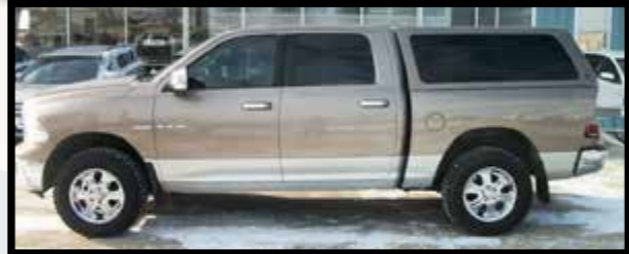
2009 Dodge Ram 1500 CrewCab 4x4 SLT, V8, leather, sunroof, 123,000 mi, Beige