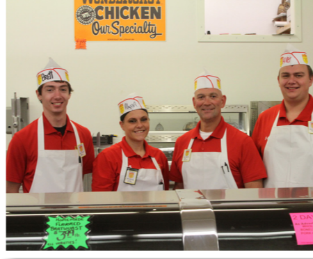
Win 1 of 2 Free $50 Beef Certificates from Fareway Food Store