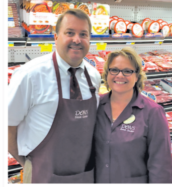
Win 1 of 2 Free $50 Beef Certificates from Don's Food Center