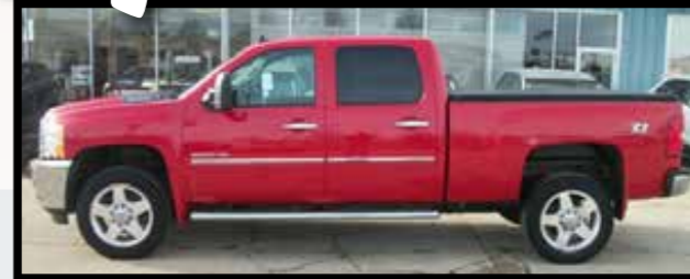
2013 Chevy 2500 HD CrewCab LT 4x4 6.0 V8, heated leather, Z71, 97,000 mi, Red,