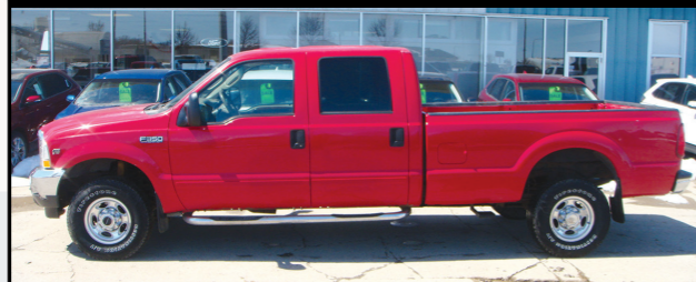
2003 Ford F350 CrewCab 4x4 Lariat, V10, leather, 8 ft box, 201,000 mi, local