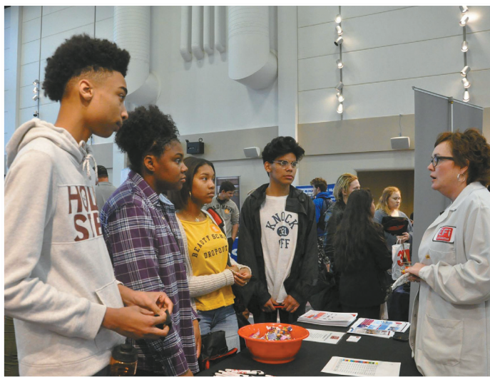
During the Career & Workforce Expo, students had the chance to discuss with professionals subjects they should study in school to prepare for certain careers.