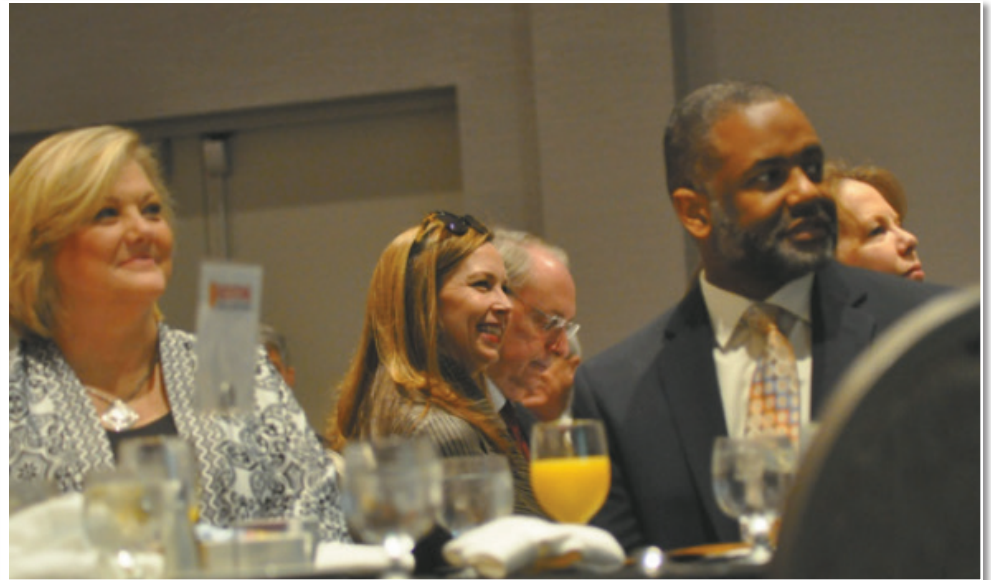
More than 175 members and guests attended the State of the County Address.