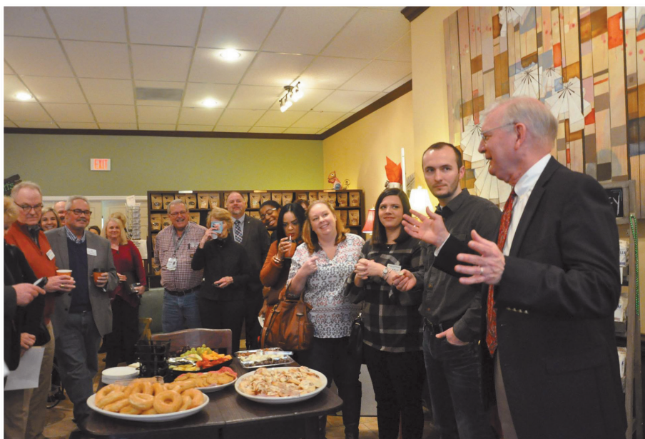
More than 50 Chamber members and guests visited "The Nut House" during the February Coffee & Cards event hosted by Tennessee Valley Pecan Company.