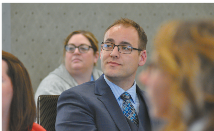
The YP Leadership Luncheon series gathers every other month to discuss development topics with community leaders.