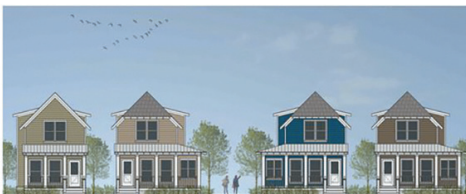
BANK STREET STATION A COTTAGE COMMUNITY IN DECATUR, ALABAMA ARCHITECTURE BY D J A D

Bank Street Station is set for development on lower Bank Street and will feature six homes.