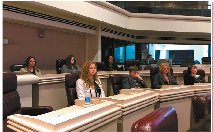
As part of their March trip to Montgomery, members of the Edge class toured the state legislature and sat in on active sessions.