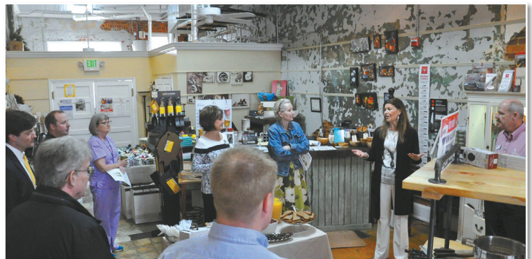
More than 50 people came to the April Coffee & Cards to learn more about Bank Street Station.

Bank Street Station is set for development on lower Bank Street and will feature six homes.