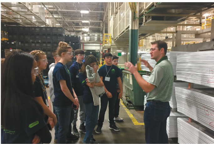
In February, Equip students toured the GE Appliances, a Haier Company facility to learn about careers in manufacturing.