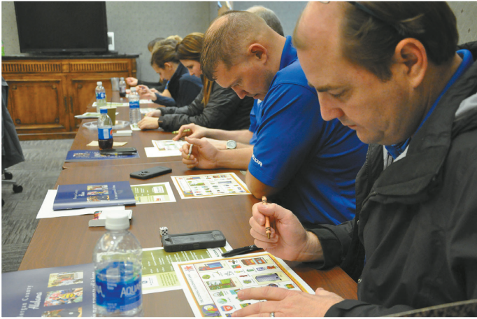
During their February program focusing on economic development, members of the Excellence class played a “board game” involving retail and industry recruitment strategies.

Memorial Baptist Church. Edge is presented by Nucor Steel Decatur .