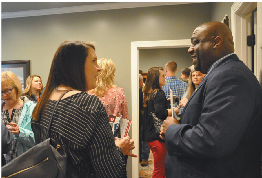
LPL Financial in downtown Decatur welcomed more than 50 guest to their newly renovated office in downtown Decatur for the March edition of Coffee & Cards.