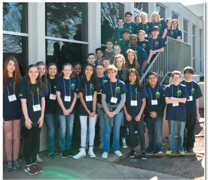
The spring session of Equip Leadership features more than 30 students from across Morgan County learning about opportunities available following graduation.