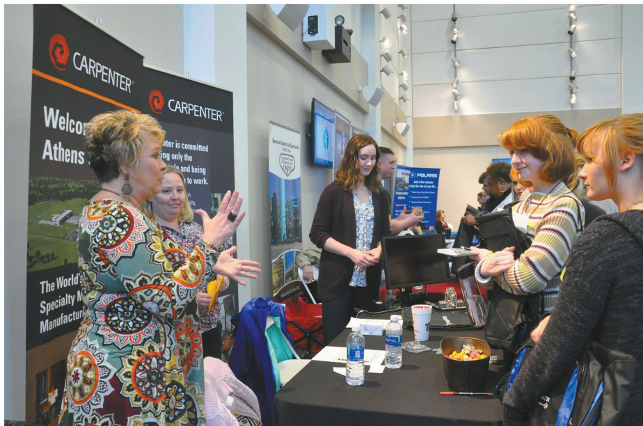
More than 1,000 area students learned about career opportunities from local industries at the annual Career & Workforce Expo.

The annual Career & Workforce Expo - presented by gold sponsor Joe Wheeler EMC , as well as silver sponsors 3M , GE Appliances , a Haier Company , Nucor Steel Decatur , Redstone Federal Credit Union and Toray Carbon Fiber America - welcomed more than 1,000 area high school students to Calhoun Community College to learn about careers and opportunities in our area following high school. Your Chamber is committed to preparing the next generation of learners and leaders in our community and equipping them for success in whatever path they choose. The Expo is a collaboration with the Chamber, Morgan County Economic Development Association, Greater Limestone County Chamber of Commerce and Calhoun Community College.