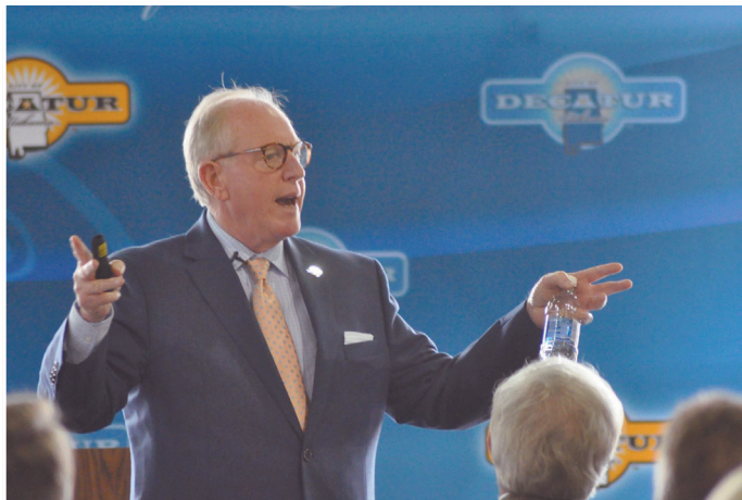
Decatur Mayor Tab Bowling shares with the audience, during the annual State of the City Address, his plans to drive development of the I-565 widening to support regional economic development.