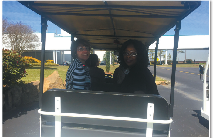
As part of their trip to Montgomery, members of the Excellence class toured the Hyundai Motor Manufacturing Facility and learned about the auto industry in Alabama.

Presenting Sponsors Equip, Excellence and Edge Leadership