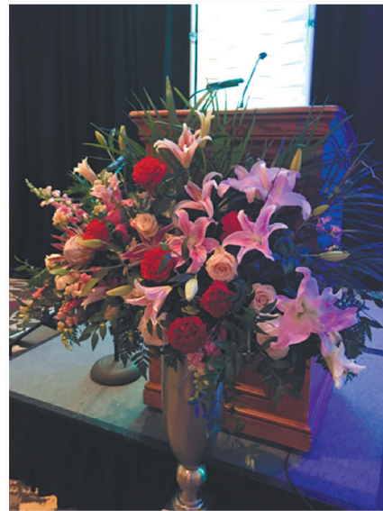
Simpson’s Florist of Decatur served as the Floral Sponsor for the 87th Annual Meeting.