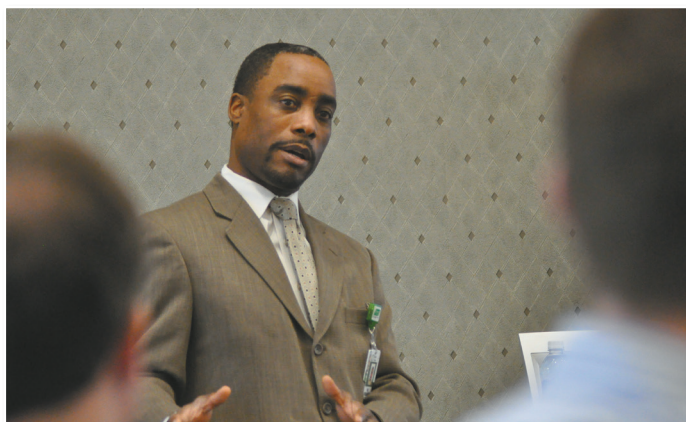
Richardson shared with the group of more than 30 the steps he and the System board took in developing a strategic plan to meet the needs of the patients and the community.