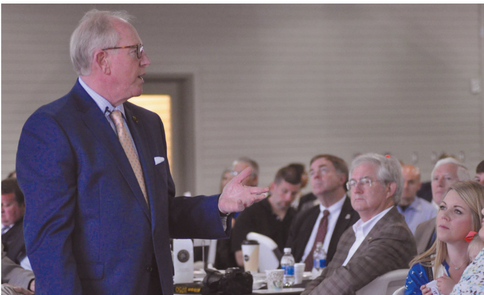
Decatur Mayor Tab Bowling welcomed more than 250 members of the business community during the State of the City Address.

and infrastructure. More than 250 in attendance - including elected officials from neighboring communities - heard Bowling talk about the need for a long-range plan for roads supporting the soon-to-arrive Mazda-Toyota assem-