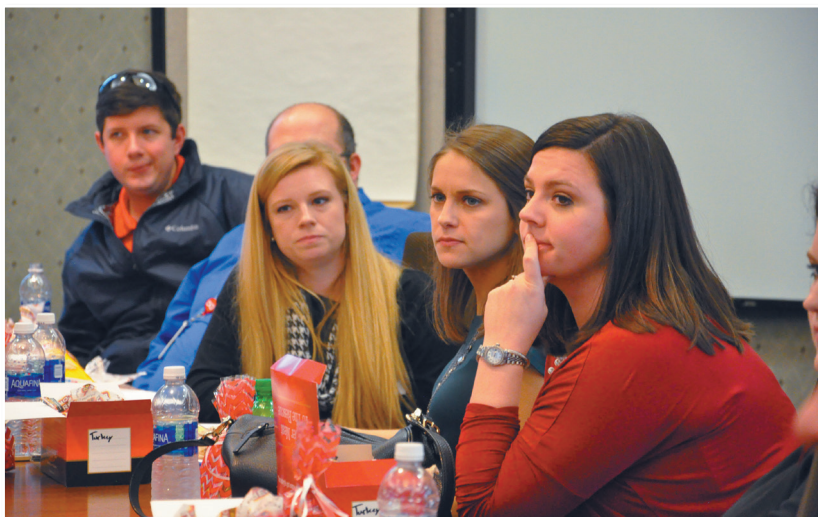
More than 40 young professionals from Morgan and Madison Counties took part in the focus group supporting the Chamber's five-year plan.