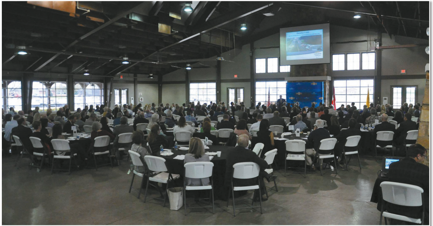
Ingalls Harbor Pavilion again served as the host site for the annual State of the City Address.