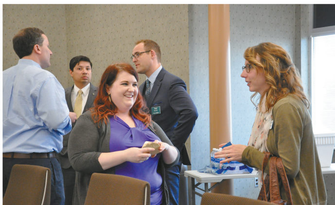
The YP Leadership Luncheon is a networking and leadership development opportunity for the under-40 crowd of Morgan County.

The YP Leadership Luncheon series is an opportunity for members of the under-40 crowd across Morgan County to both connect and socialize while developing their leadership skills. The series is presented by Ascend Performance Materials of Decatur , as well as April lunch sponsor Kiwanis Club of Decatur . The next YP Luncheon will be held in late June.