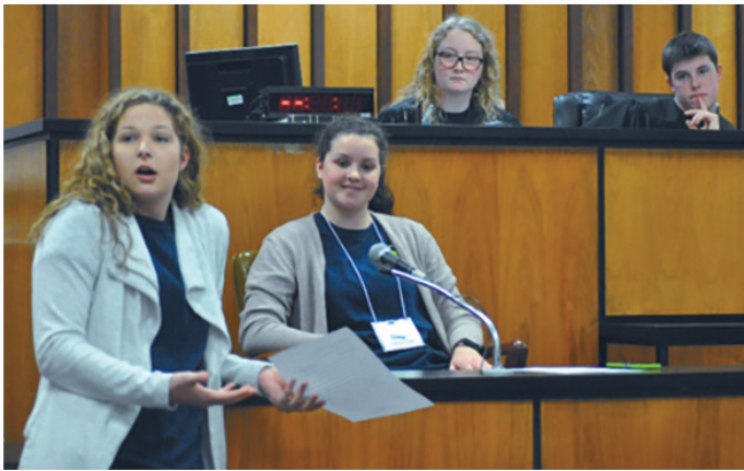
In February, members of the Edge class took part in a mock trial as part of their focus on the criminal justice system in Morgan County.