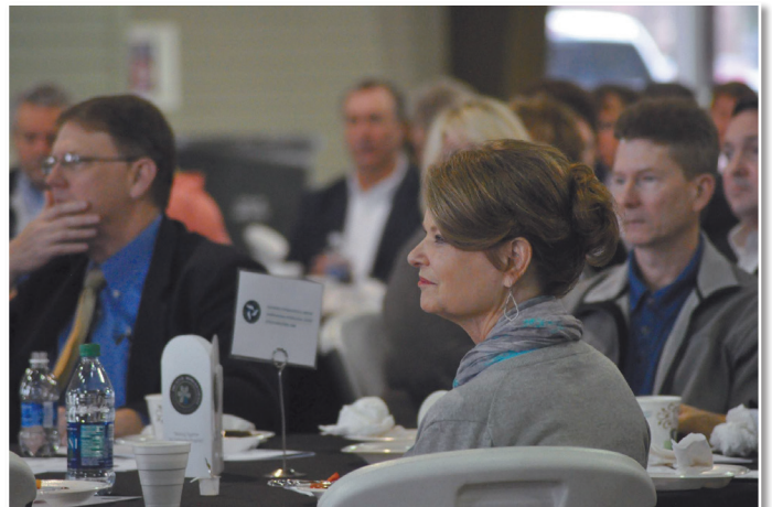
More than 250 attended the annual State of the City Address.