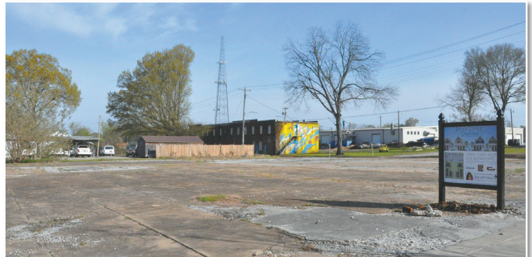
Across the street from Magnolia River on Bank Street, the six-home development will feature a first-of-its-kind urban residential opportunity in Decatur.