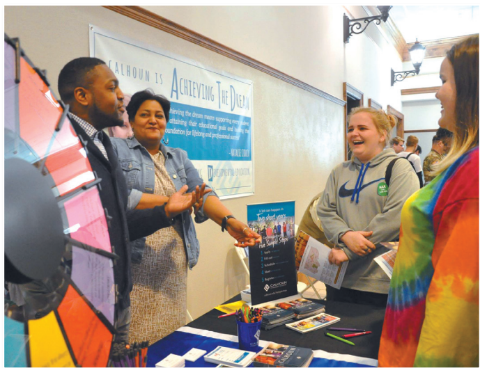
Career coaches from event host Calhoun Community College were on hand to discuss career paths during the Career & Workforce Expo.