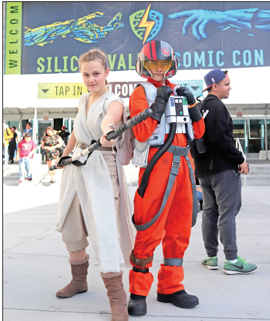
Cosplay ruled the day: A dynamic duo dressed up as Rey and Poe Dameron from "The Last Jedi." At right: Tony Dow and Jerry Mathers from "Leave it to Beaver" answer fans' questions.

Stan Lee (co-creator of "Spider Man", the "Avengers", the "X-Men", and many others), a legend at any comic book convention, made an appearance all three days of the event, offering photo ops and autographs. Lee, at 95 years old, was just recovering from