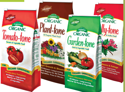
Keep your Flowers & Vegetables Happy & Healthy by using Espoma

Save your Herbein's Bonus Bucks and use them for a future purchase.