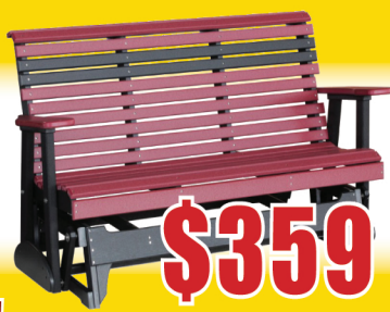
Rollback Double Glider

Giving you the LOWEST pricing all season long!