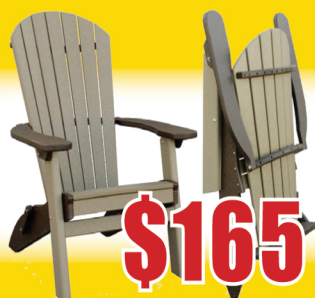
Folding Adirondack Chair