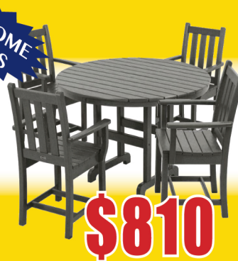
5 Piece Patio Set