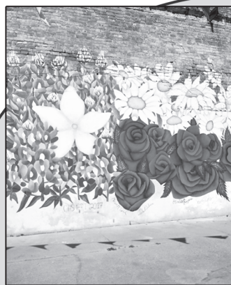
Wall Painting in Celeste

Civic pride is in plain view however, with a small roadside park, some really beautiful colorful brick wall art downtown, and an interesting cemetery. Their school basketball team is called the Celeste Blue Devils, and a billboard along the highway labels it "Small Town with a Big Heart". Perhaps the biggest claim to fame of Celeste, Texas is that war hero and movie star Audie Murphy once lived there. He attended the Celeste school until he dropped out after the eighth grade to help support the family.