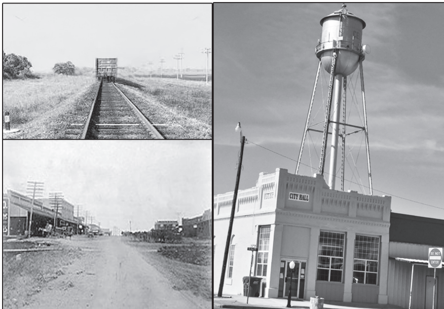
Old Celeste Street (1905-1909)