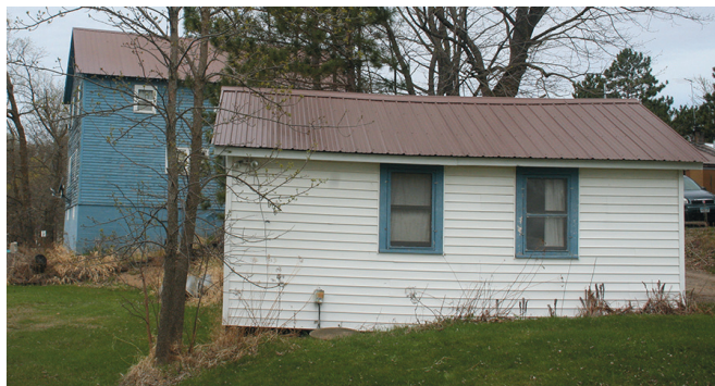
Historic buildings on the resort include older cabins and the main lodge in blue behind the cabin.

in the campers and the main house. You can smell burgers on the grill and campers are snug around their fires, watching for the stars to come out.