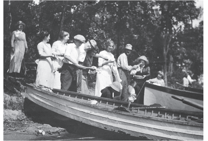
An early group of boaters at Ruttger's Bay Lake Lodge