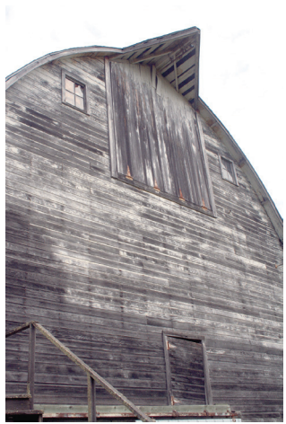
This barn was built in 1915 and the resort was once a working farm.