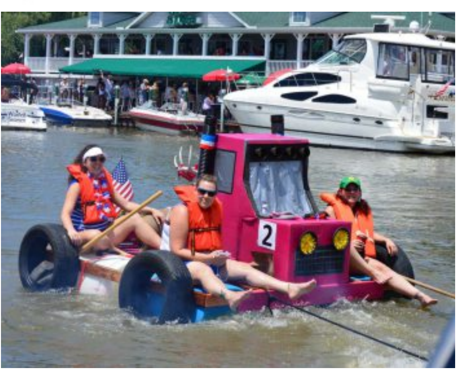
The Crazy Craft Races take place at 1 pm on the Vermilion River. The event is open to all, so all you need is some imagination to build whatever kind of vessel inspires you. Take in all the beautiful Antique Wooden Boats in the Antique Wooden Boat Parade. The annual Lighted Boat Parade takes place at dusk on the Vermilion River on Saturday.