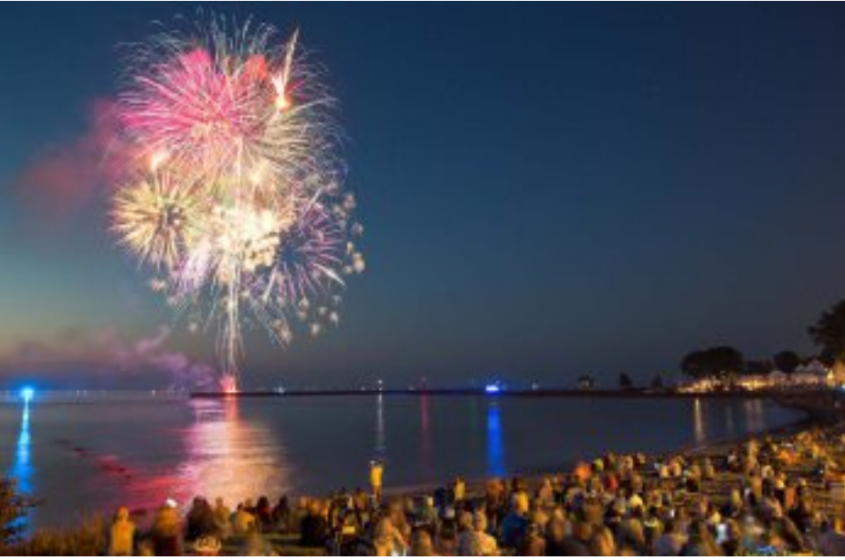
Friday June 15th Festival FIREWORKS: Festival of the Fish FIREWORKS Friday, June 15th at dusk over beautiful Lake Erie off the break wall, best place to watch Festival grounds or Main Street Beach!

Mention this ad for your Extra 10% Savings Off Our Everyday Discount Pricing on In-Stock Merchandise. Does not apply to Clearance or Buy-One-Get-One-FREE items.