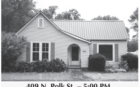
409 N. Polk St. - 5:00 PM

2 bedroom/2 bathroom vinyl sided home with metal roof, covered porch, storage building, 200 amp circuit breaker box, some replacement windows, jacuzzi tub in master bath, gas log fireplace and more on approximately 84x200 R-2 lot.