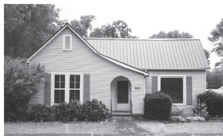
409 N. Polk St. – 5:00 PM

409 N. Polk St. & 305 E. Lauderdale St. • Tullahoma