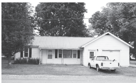
305 E. Lauderdale St. – 5:30 PM

2 bedroom/2 bathroom vinyl sided home with metal roof, covered porch, storage building, 200 amp circuit breaker box, some replacement windows, jacuzzi tub in master bath, gas log fireplace and more on approximately 84x200 R-2 lot.