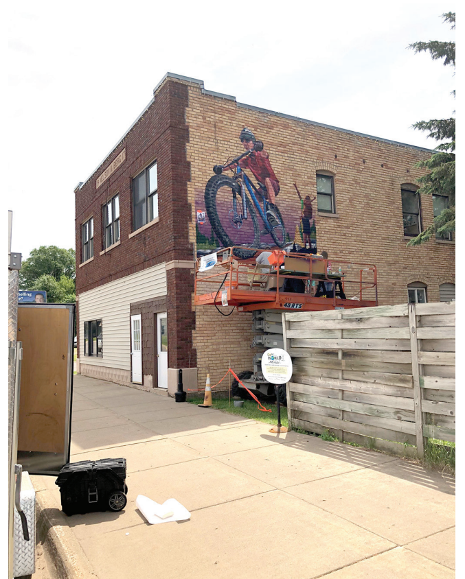
Mountain biking will be featured on the mural on the building at 102 4th Street in Ironton.

Funds are available for four more murals. Over the next two years, there will be two more walls selected for murals in both Crosby and Deerwood.