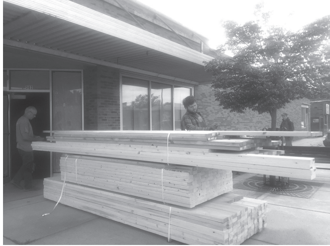
Renovations have begun in downtown Aitkin to transform the former furniture store into a restaurant/brew pub.