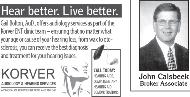
Orange City and Sioux Center • 707-9585 • korverent.com