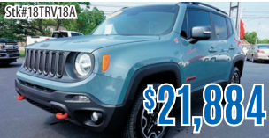
2017 Jeep Renegade Trailhawk