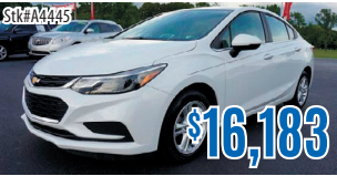
2016 Chevrolet Cruze LT