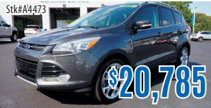
2015 Ford Escape Titanium