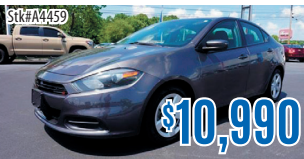
2016 Dodge Dart SXT