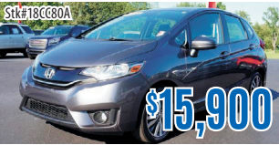
2016 Honda Fit EX