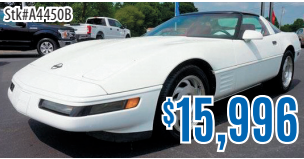
1993 Chevrolet Corvette Base