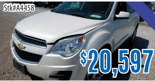
2015 Chevrolet Equinox LT 1LT