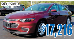
2016 Chevrolet Malibu LT 1LT