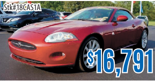
2007 Jaguar XK Base