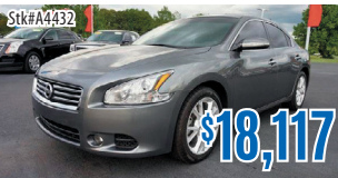
2014 Nissan Maxima 3.5 SV