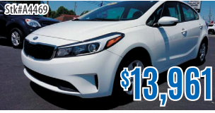
2017 Kia Forte LX