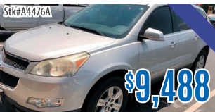
2009 Chevrolet Traverse LT 1LT