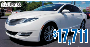
2014 Lincoln MKZ Hybrid