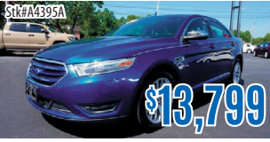
2013 Ford Taurus Limited