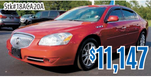
2011 Buick Lucerne CXL Premium