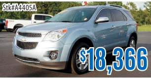
2014 Chevrolet Equinox LTZ