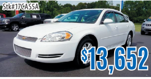
2016 Chevrolet Impala Limited LT