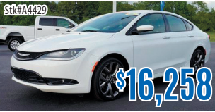
2015 Chrysler 200 S