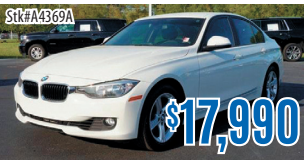
2015 BMW 3 Series 328i