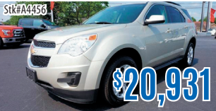
2015 Chevrolet Equinox LT 1LT