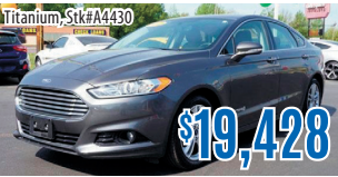
2015 Ford Fusion Hybrid