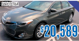
2013 Toyota Avalon Limited