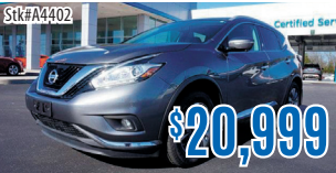
2015 Nissan Murano SL