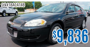
2012 Chevrolet Impala LT