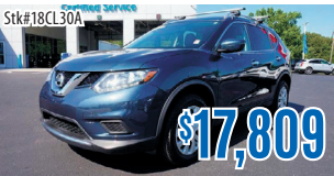
2016 Nissan Rogue SV