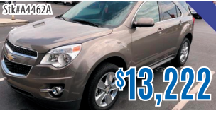
2012 Chevrolet Equinox LT 2LT