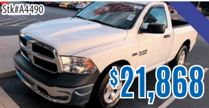
2014 Ram 1500 Tradesman