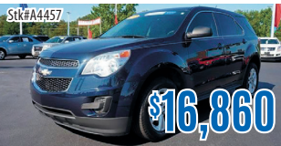
2015 Chevrolet Equinox LS