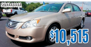
2009 Toyota Avalon Limited