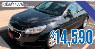
2015 Chevrolet Malibu LT 1LT