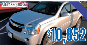
2009 Chevrolet Equinox LT 1LT