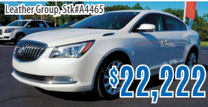
2015 Buick LaCrosse