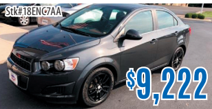
2014 Chevy Sonic LT