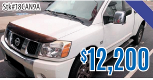
2004 Nissan Titan LE