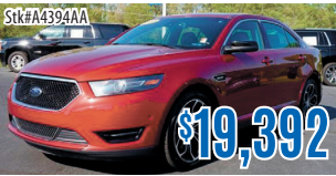
2013 Ford Taurus SHO