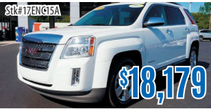
2015 GMC Terrain SLT-2