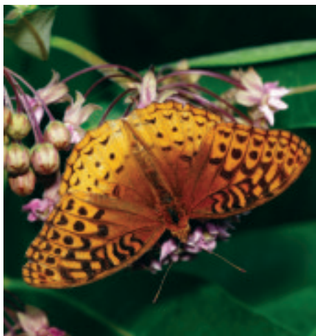
Great spangled fritillary on common milkweed

Plants that produce seeds need to be pollinated in order to reproduce. The seeds store complete sets of genes needed to create new plants. In order for seeds to develop, genes from different parts of plant flowers must be exchanged. Pollination describes the process of completing this exchange and pollinators are the insects